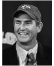
Coach Art Briles

Art Briles is Baylor's 25th football coach. Art is a native West Texan who grew up in Rule, Texas. After playing wide receiver at the University of Houston, Art became a high school coach in 1979. He spent eleven years with Stephenville High School and took the Yellow Jackets to four state championships and a six-year run of 90-2-1. Coach Briles took the position of head coach at the University of Houston in 2003, and for five seasons led them to four bowl appearances and a Conference USA title in 2006.