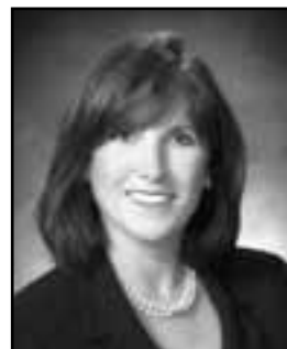
JUDGE VICKI MENARD