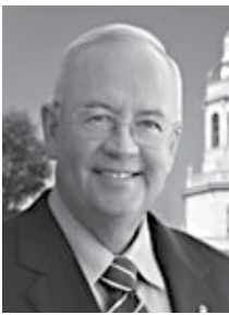
Judge Kenneth W. Starr

Judge Kenneth Starr has had an excellent career in academia, law and public service. He served for six years as Dean and Professor of Law at Pepperdine University, teaching constitutional issues and civil procedure. Starr was born in Vernon, Texas, graduated from Sam Houston High in San Antonio, earned his B.A. from George Washington University, his M.A. from Brown, and his J.D. from Duke in 1973.