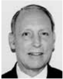
CRAWFORD LONG LAW