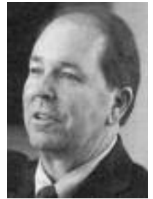
Senator Kip Averitt