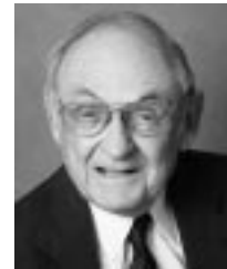
JUDGE BILL LOGUE RECIPIENT 2005